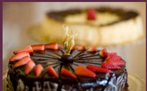
Phoenix Restaurant English buffet breakfast 07:00 - 10:30 hrs A la carte dinner 19:00 - 22:00 hrs Terrace open for al fresco dining in summer ( weather permitting )