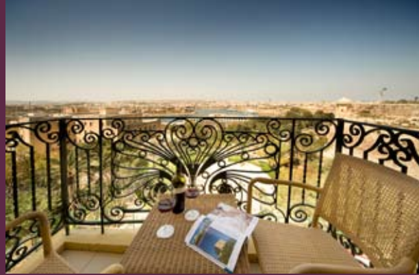
View from a Harbour Room with Balcony