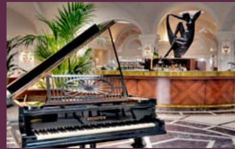
Palm Court Lounge - open all day from 09:00 - 23:00 hrs