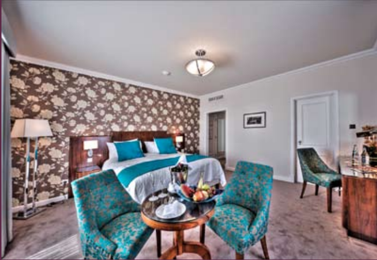
New Bedrooms on 3rd and 4th floors

Following 3 months of extensive refurbishment of the Palm Court Lounge, Phoenix Restaurant, Lobby and Reception areas, the Club Bar and all the bedrooms and suites on the 3rd and 4th floors, the Phoenicia is welcoming your guests in luxurious surroundings, unparalleled in Malta.